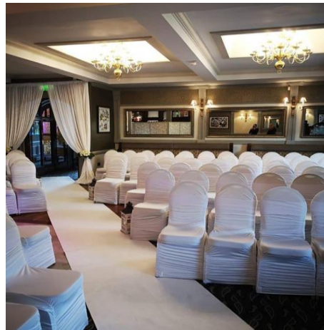
Lay out of 'Budore Room' available for Civil Ceremonies